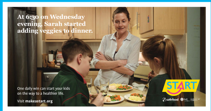
Examples of our outdoor messages.