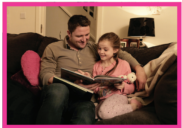
Reduce screen time by taking story time off line.